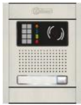
(1) Aluminum NEXA Door Station (supplied with FLUSH back back box), with 1 to 10 push-buttons. 1-Button model shown