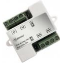
D2L-GB2 2-way video bus splitters (qty. of 0 to 5 depending upon kit selected)