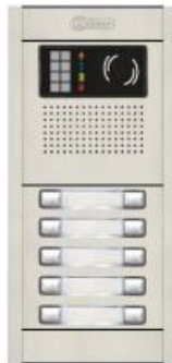
(1) Aluminum NEXA Door Station (supplied with FLUSH back back box), with 1 to 10 push-buttons. 10-Button model shown