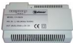
(1) FA-GB2/B System Power Supply/Amplifier