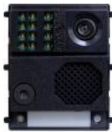
(1) EL632/GB2B Camera and Speaker/Mic. Module (installed into the NEXA panel)