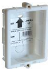
(1) Flush plastic back box for the NEXA panel (model# NCEV-90CS shown)